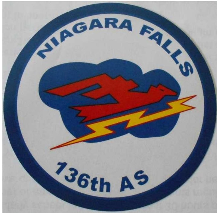
Thunder Chicken used to be painted on the units F-101's & F-4's.