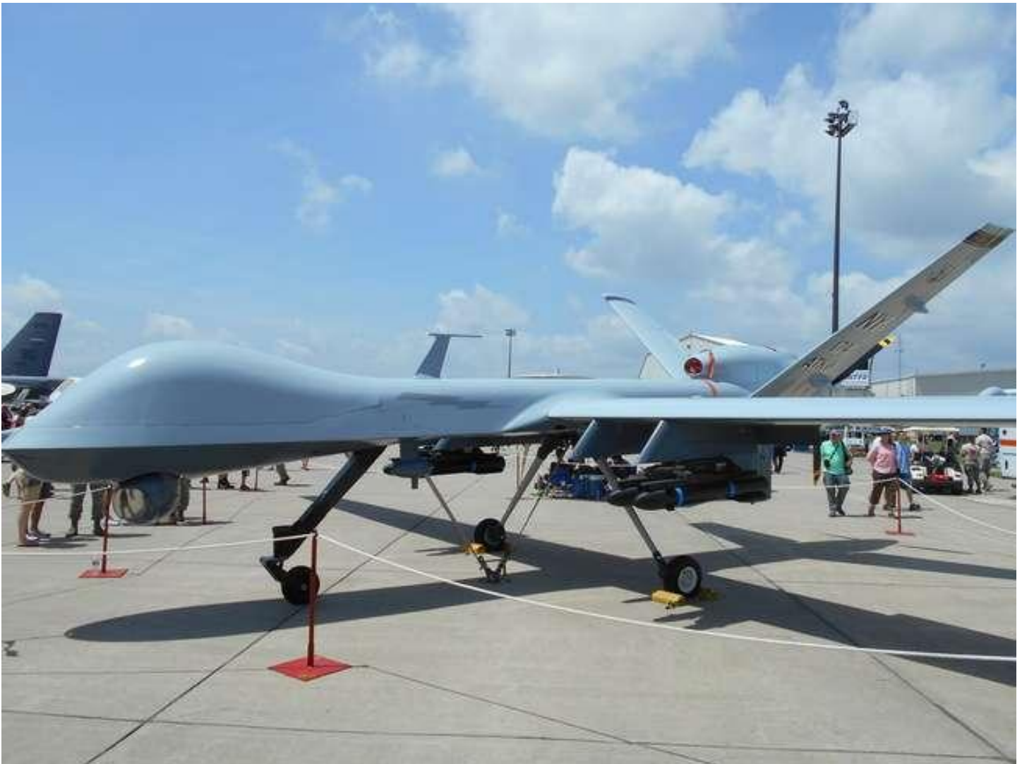
MQ-9 Reaper replica in 1/1 Scale, Note the enhanced weapon load capability (Above) RF-101 Voodoo Gate Guard (Below)