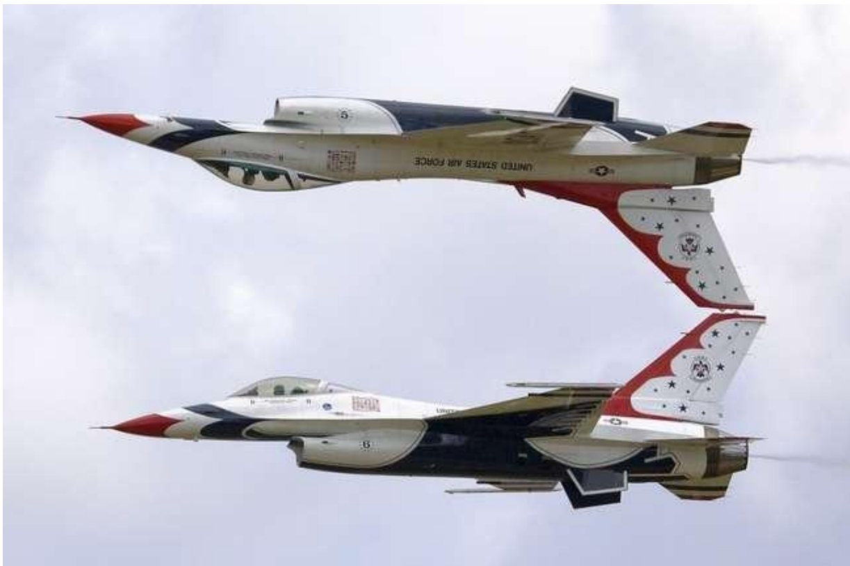
US AirForce Thunderbird F-16 Fighting Falcons

Remember when there was an airshow every year at Link Field and Wilkes-Barre airports? Now either have an airshow budget in near sight. I miss the sound, smells and sights of a good airshow. All the pictures in this article are the editors, except for the Thunderbird F-16, which was from a Website. 👍