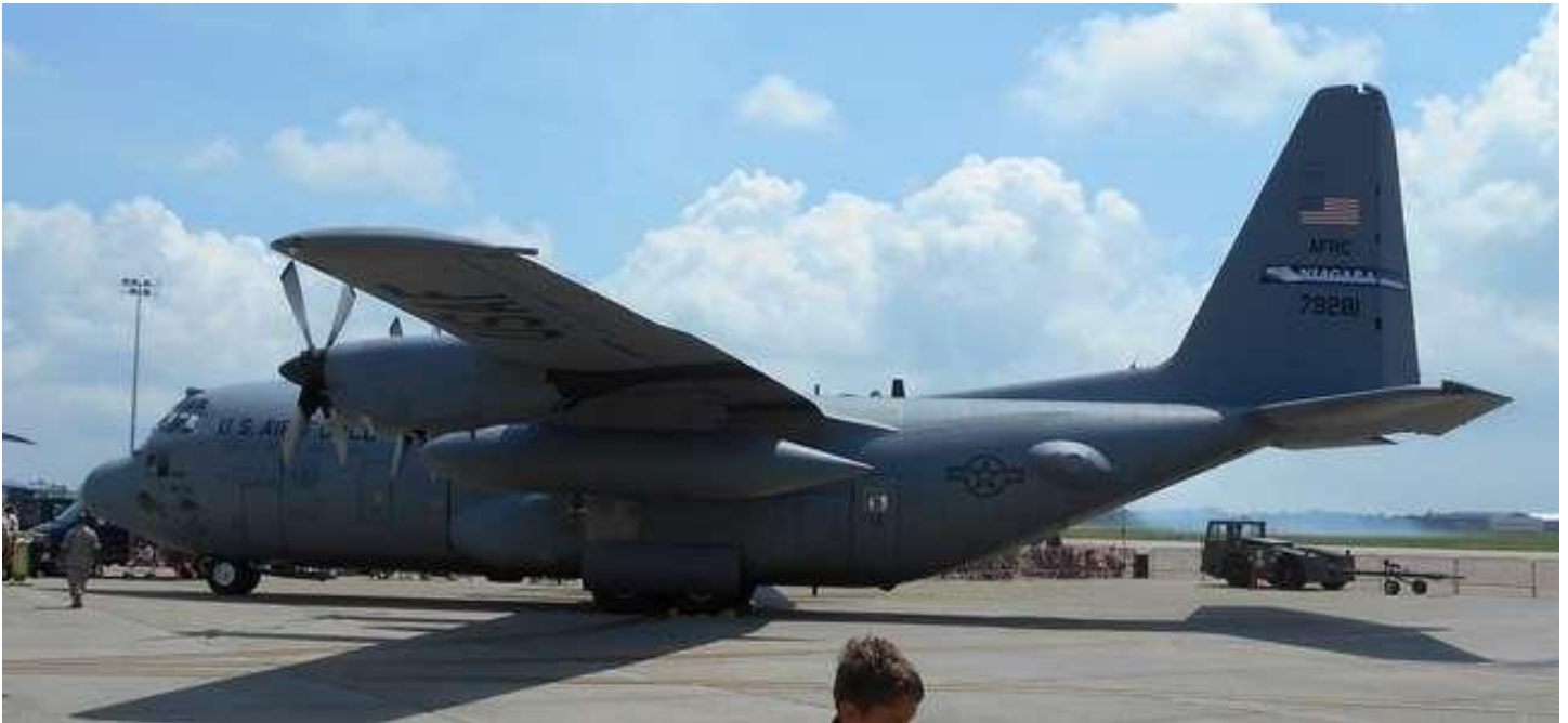
Niagara Falls 914 AW, 136 AS C-130 "Spirit of Western New York", Note the Nose and tail markings

Demonstration aircraft kept the sky full of aerial activity. The distinctive sound of the Merlin-Rolls Royce engine defined the silver P-51 Mustang. A T-6/SNJ and the Trojan Horsemen, a team of six T-28's, put on a good acrobatic performance. The AV-8b Harrier deafened the crowd with its' loud engine while hovering and super heating the runways concrete with its' exhaust. The AV-8b also displayed it's unique flying and hovering capabilities. A rare flying Mig-17 was spitting out lots of flames from its' engine, Sidewinder waiting. The host unit, 914 Airlift Wing C-130's executed a parachute extraction of Hummer at 1000 feet over the runway. The US Army Golden Knights Parachute Demonstration team thrilled the crowd with their death defying drops. The main star of the show, the US Air Force Thunderbirds, loved to surprise the crowd with low level Zooming from behind. Their engines roar was amplified by the humid air.