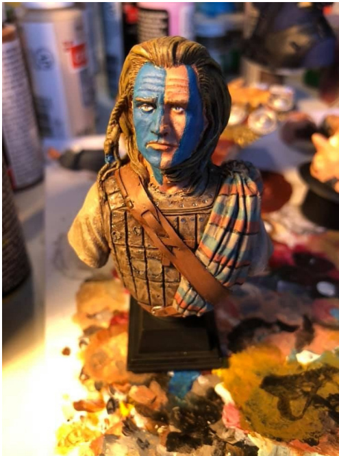
Braveheart by Joe McDonald Jr.

MassCar 2020 – Cancelled Wings & Wheels 2020 – Cancelled Downeastcon 2020 – Cancelled Northshore Con 2020 – Cancelled IPMS Nationals 2020 – Cancelled Patcon 2020 - Cancelled Granitecon 2020 – Cancelled BAYCON 2020 – Cancelled